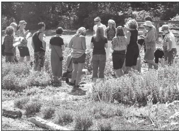
HERBALISTS AND HERBAL enthusiasts gather at Innisfree Farm in Royston for a weekend of everything herbal.